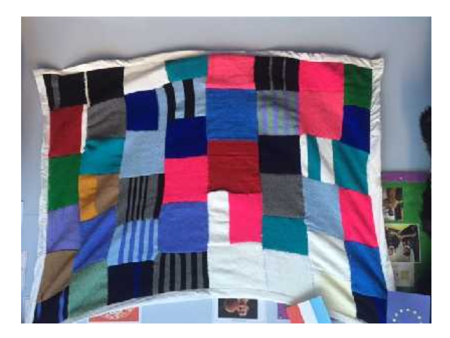
The quilt produced by pupils and staff of the East London Independent School